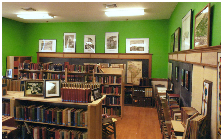
The Old Book Room of the Jerome Public Library houses many collections, including Voltaire, Shakespeare, biographies, local art and old photos.

Or call for an appointment – library staff will be happy to open the Old Book Room for you.